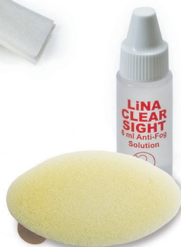
LiNA Clear Sight