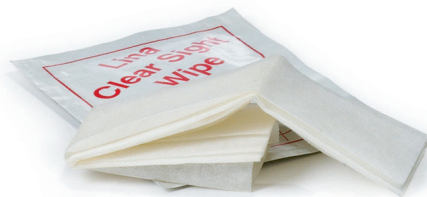
LiNA Clear Sight Wipe

LiNA Clear Sight Wipe is prefilled with antifog solution and individually packed in a peel pouch. The LiNA Clear Sight Wipe is only available without alcohol.